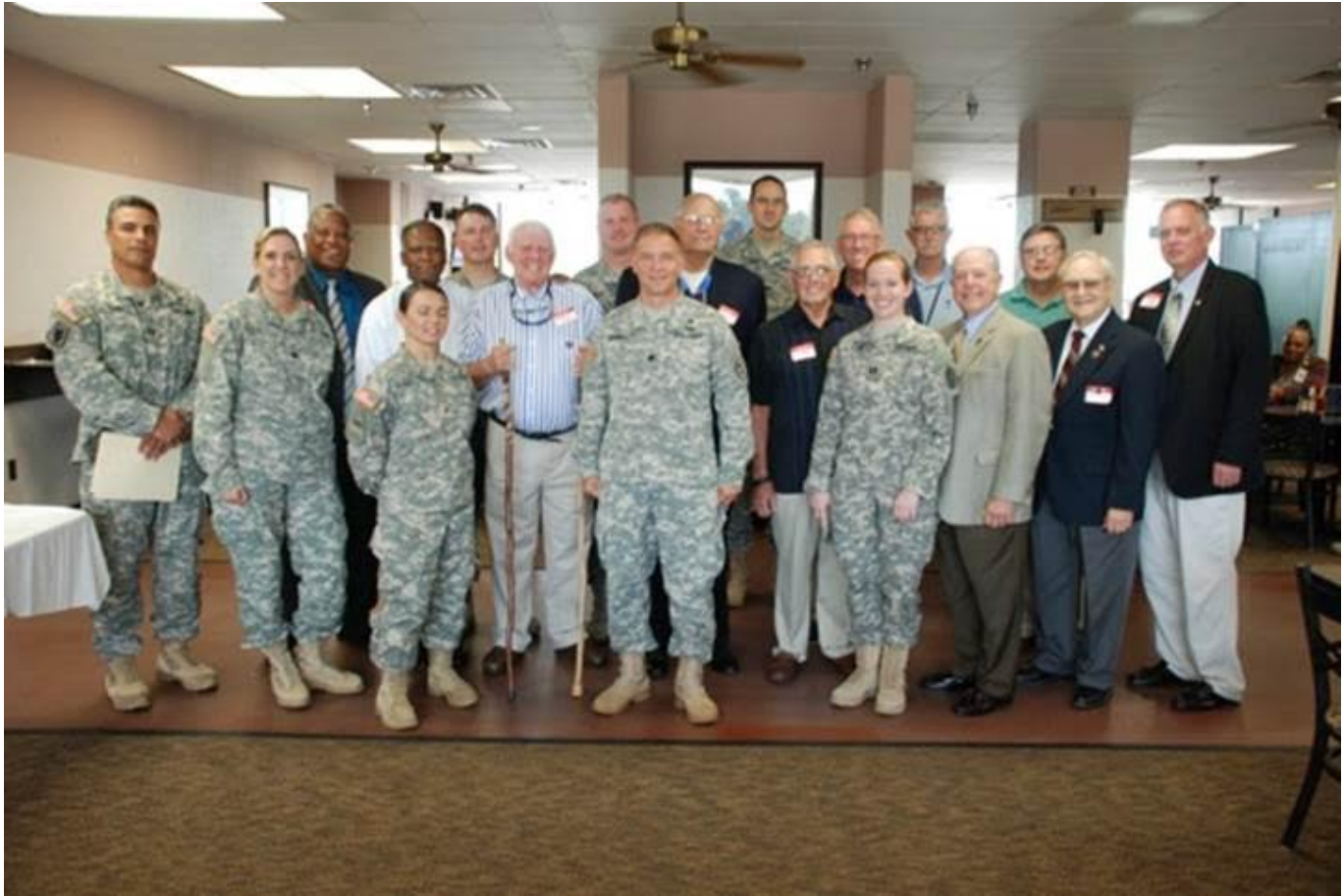
Attendees at Moncrief ACH