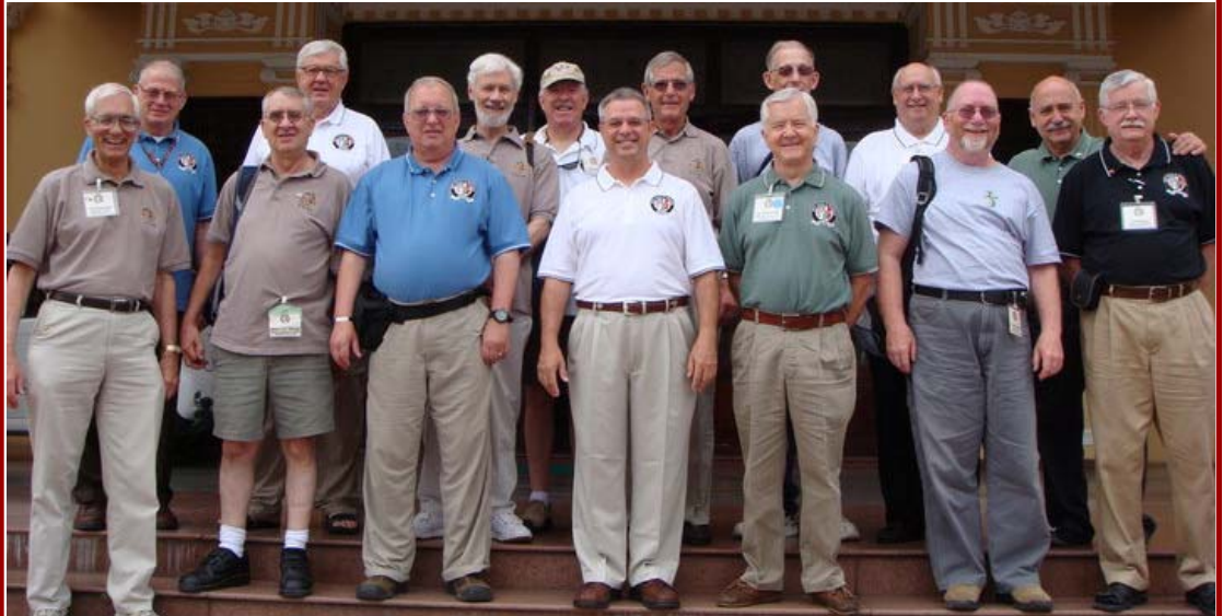
The group picture is that of our group of vets in Hue ( I am on the extreme left ).

The other picture was taken while I was assisting in delivering food to poor rural families with disabled children. The little girl in the second photo is subject to seizures and lives alone during the week while her mom works in Danang several hours drive to the north.